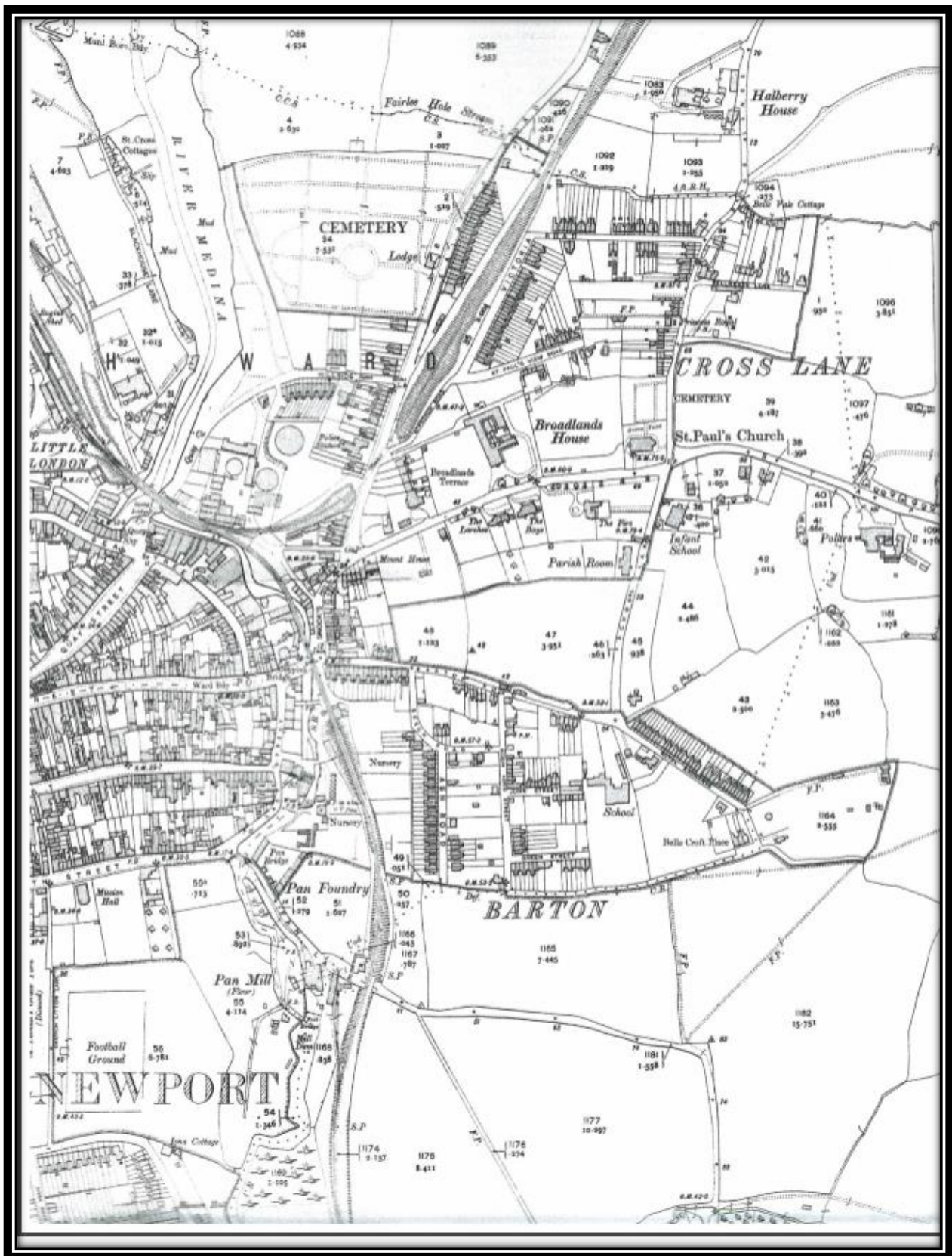
Barton Village at the time of The Great War