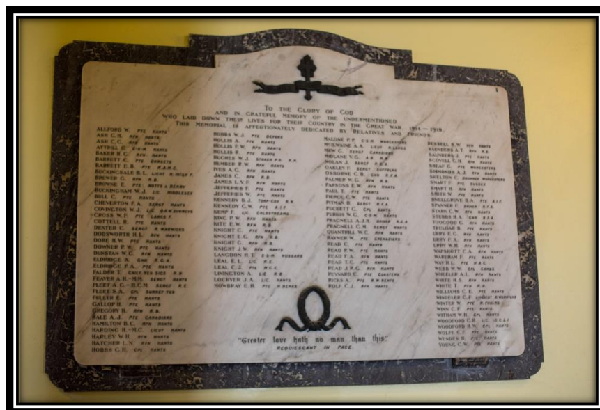
St Paul's Church Barton Memorial