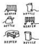
PORTABLE CHURCH APPLIANCE TESTING