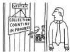
TAKING AN UNUSUAL INTEREST IN THE STATE OF THE FINANCES