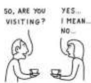
SO, ARE YOU VISITING? YES... I MEAN... NO... APPEARING EVASIVE WHEN ASKED QUESTIONS