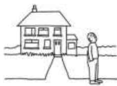
LOITERING NEAR THE VICARAGE