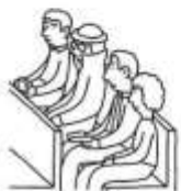
TRYING TO BLEND IN

CHARACTERISTICS OF POTENTIAL NEW VICARS VISITING UNANNOUNCED DURING A VACANCY