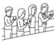
KNOWING A BIT MORE OF THE LITURGY THAN IS NORMAL