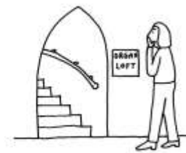
TRAVELLING TO NEW PLACES