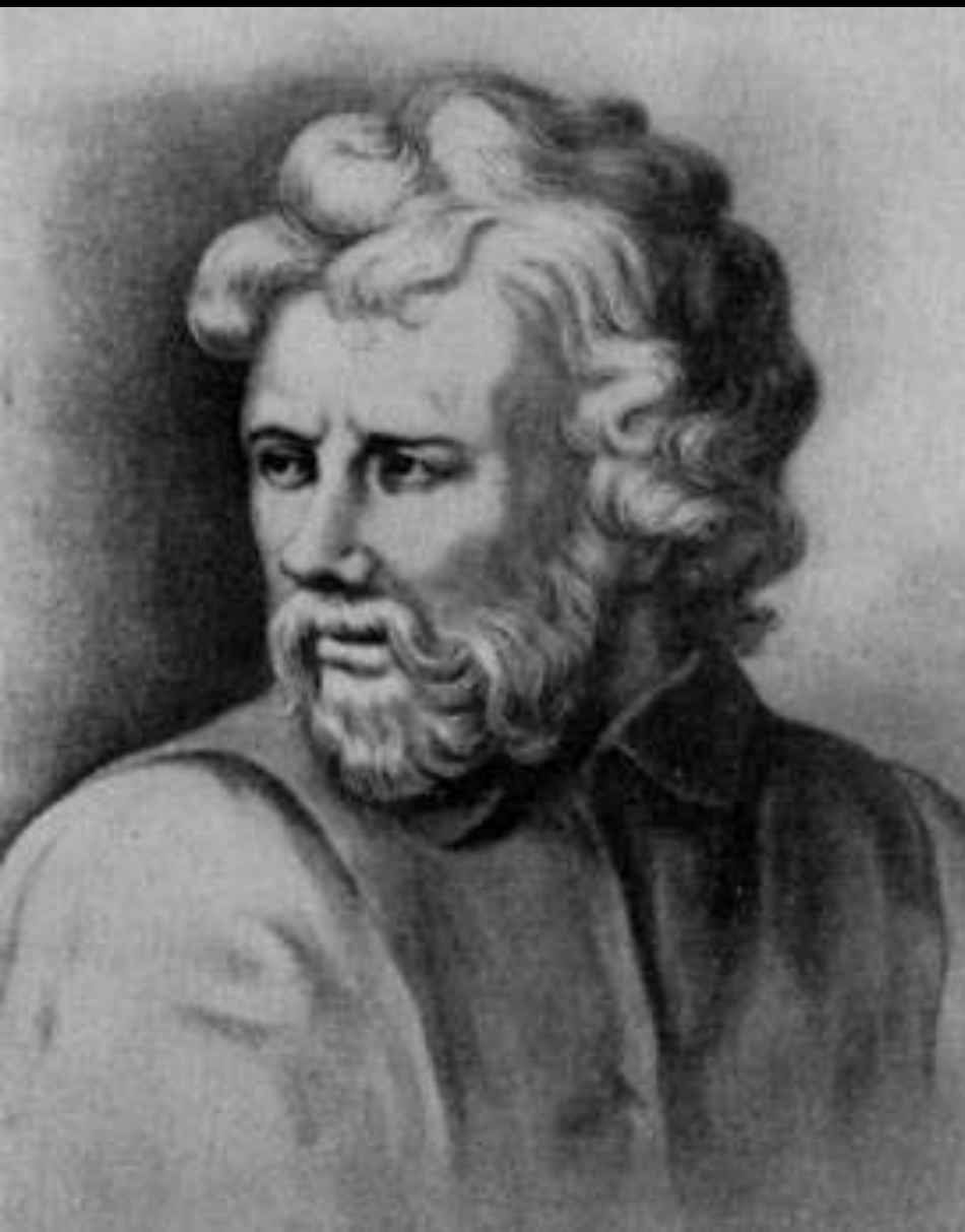
Epictetus (55- 135 AD)

"While the emperor may give peace from war on land and sea, he is unable to give peace from passion, grief, and envy; he cannot give peace of heart, for which man yearns for more than even outward peace."