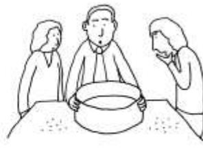
SOMEONE HAS EATEN ALL OF THE BISCUITS