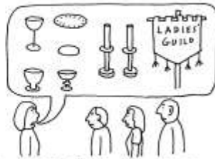
OUR MOST PRECIOUS ARTEFACT HAVE BEEN STOLEN