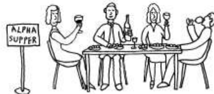
IT IS A SEASON OF ABSTINENCE AND FASTING