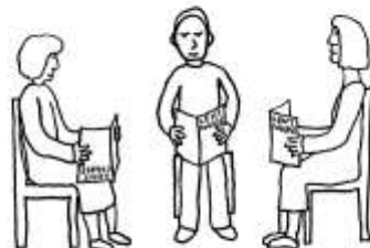
OTHERS CHOOSE TO CARRY OUT ACTS OF PENANCE