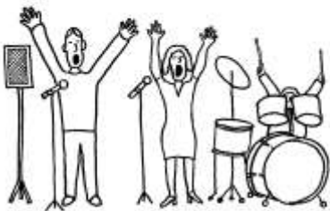
LENT IS A TIME FOR QUIET REFLECTION AND CONTEMPLATION